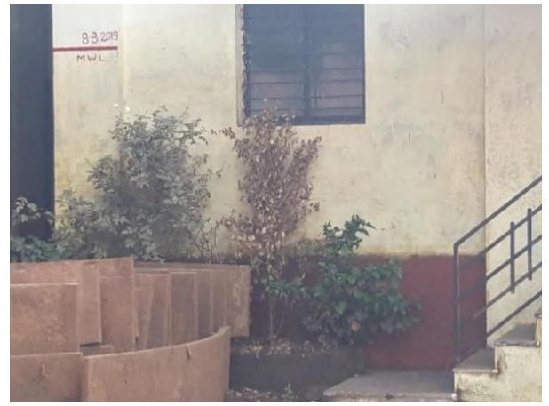
Water level during the floods in this area