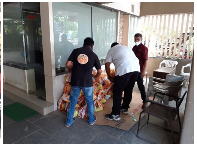
Preparing the relief materials (Ration, Donkey feed, Medicines) for relief work