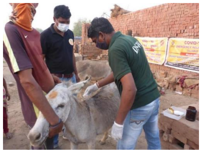
Health Camps organised (Welfare assessment, Treatment, Vaccination, Deworming and Hoof care)