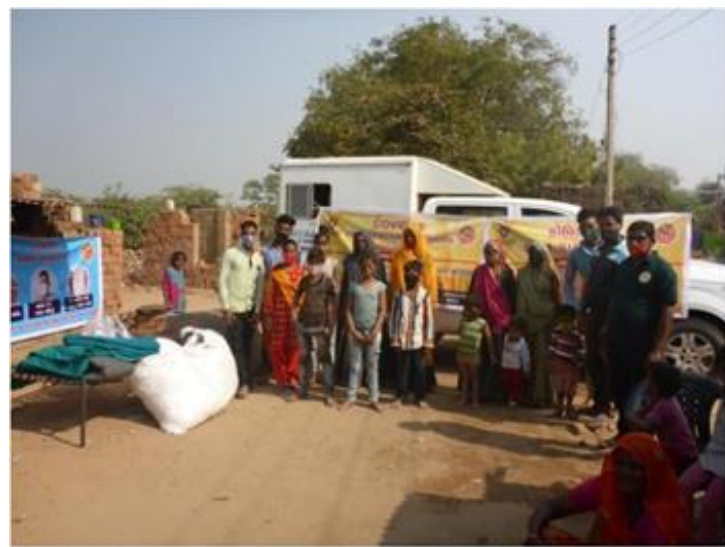
Materials required to produce the back protectors distributed to the women at the brick kilns