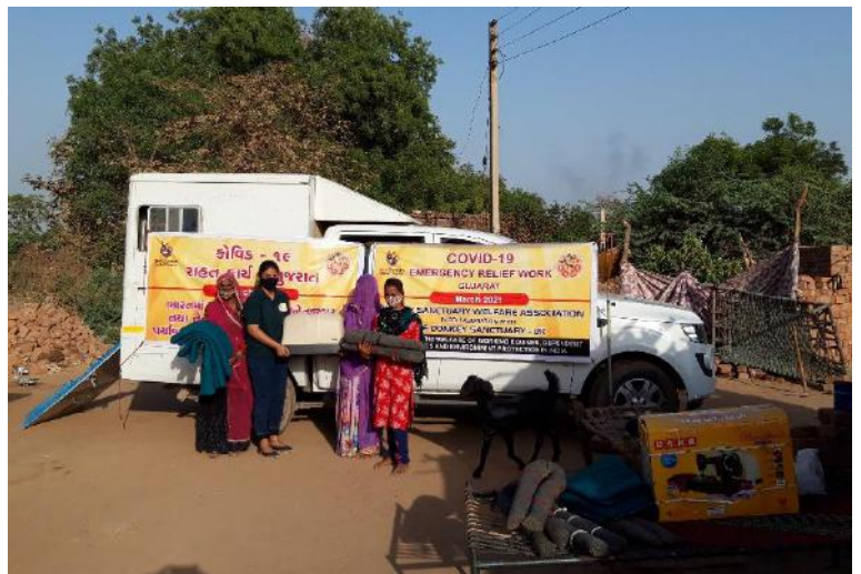
Sewing machine distributed to the women at farm and at brick kiln