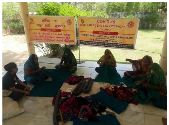
Workshop for women at Ahmedabad donkey farm